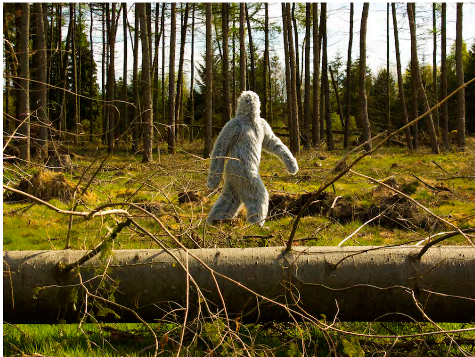
Figure 2. "I, the Thing in the Margins," Deluxe C-type print.