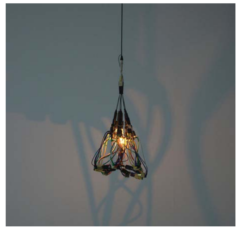
Figure 2. Self-Portrait as a Pataphysical Object (T. Lauschmann, 2006)

Suppose we call this gesture of making a technology emerge from its ground one of "figuring" and undertake to seek further examples of its function in Lauschmann's art. In Self-Portrait as a Pataphysical Object (2006), a chandelier made of cables and audio adaptors harbors a tiny light source.<sup>14</sup> Here, the relation of "figuring" is reversible: if we apprehend the cabling as figure, this calls attention to functional and material aspects of the electrical process that are normally deeply "grounded" in our use of electrical appliances. On the other hand, if we apprehend the light source as figure, this will provoke different reflections. The work has been read, for example, as a comment on the precarious nature of man's "soul" in a technologically mediated world, but it might equally be viewed in a more ecological sense, perhaps as denoting the sheer scale of the technological infrastructure (the cabling as ground) that stands behind even the smallest use of electricity (the light as figure).<sup>15</sup>