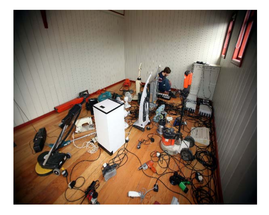
Figure 7. Piecework Orchestra (T. Lauschmann, 2007)

In the 2004 performance piece Wunst , for example, Lauschmann presented his audience with a series of musical instruments upon which they were invited to perform together without concern for the gaps between their abilities.<sup>38</sup> For the 2007 installation Piecework Orchestra , he programmed forty household devices — from electric drills and sanders to hedge trimmers and vacuum cleaners — to play his composition "Comfort Killed the Cat." Here, gaps were opened and exploited between the technologies and the purposes for which the manufacturers intended them.<sup>39</sup> For one of the key works included in Startle Reaction , a piece entitled Dear Scientist , Please Paint Me , visitors were encouraged to use electric light sources to make luminous marks upon the wall of the gallery; in many cases, this involved turning smartphones into paintbrushes, thus exposing a gap between the complexity of the technology and the simplicity and playfulness of the activity.<sup>40</sup>