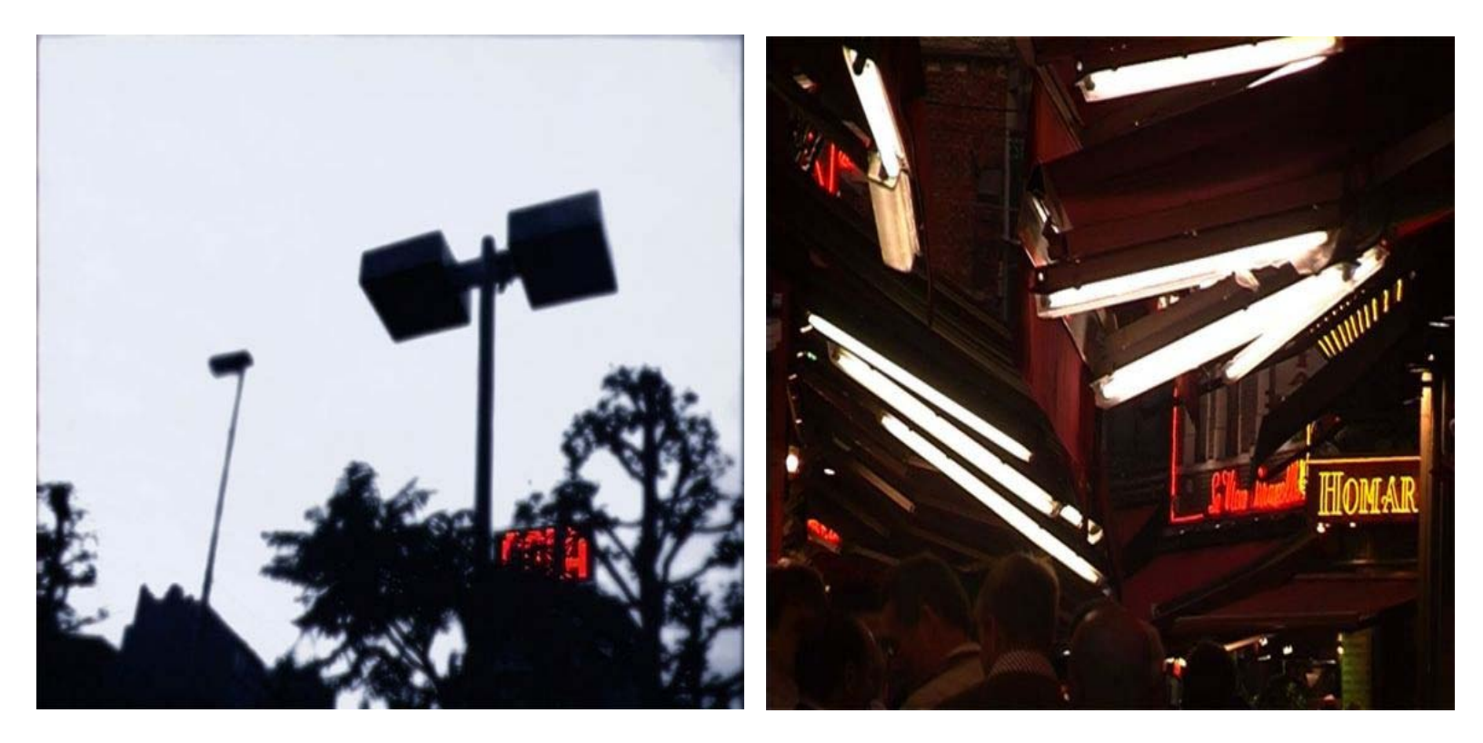
Figure 1. Misshapen Pearl (T. Lauschmann, 2003)

The "everyday" perspective maintains that a streetlamp is too trivial a thing to merit attention. It is for precisely this reason, however, that it works as a focus for Lauschmann. By turning the streetlamp into figure, "Misshapen Pearl" draws attention to the ubiquity of a technologically mediated situation that can nevertheless be highly specific in terms of how it constitutes contemporary urban experiences. The viewer is invited to reflect on the extent to which a city's ubiquitous lights condition specific patterns of behavior: like flames to a moth, these lights can channel nocturnal movement; like artificial suns, they can turn night to day, setting new rhythms for play, work, and rest; like guard rails on a bridge, they can be something that one takes for granted precisely until they are not there.