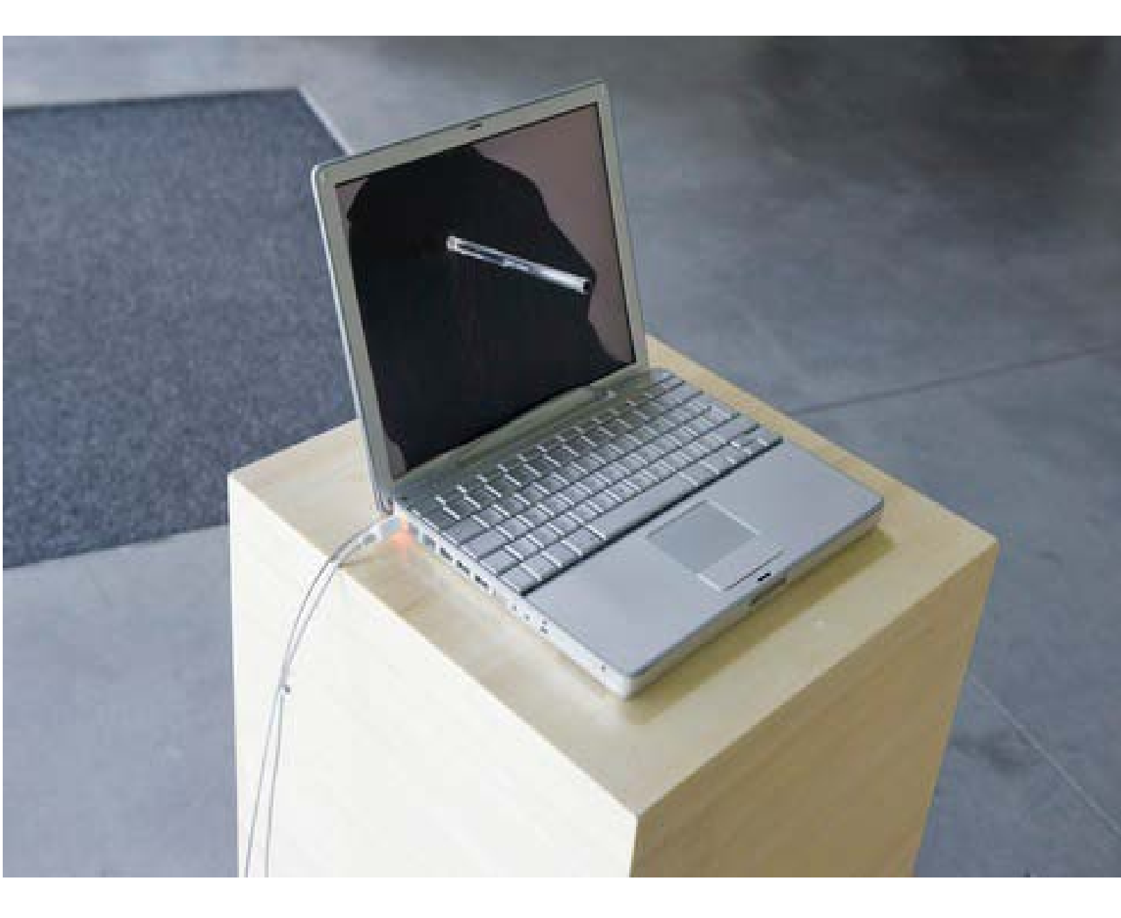
Figure 5. He's Got the Whole World in His Hands (T. Lauschmann, 2009)

technologies under the banner of "Technology" or "enframing" in Heidegger's approach.<sup>37</sup> Lauschmann invites us to reflect that while it is relatively apparent to the average user of a pen how it might be repaired, replaced, or foregone, these issues become more complex in the case of a computer. One reason why a computer's breakdown seems to announce a split between our mode of Being-in-the-world and that of technology is that the average user is