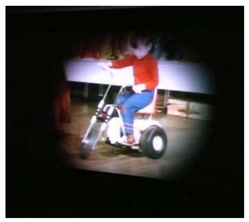
Figure 9. At the Heart of Everything a Row of Holes (T. Lauschmann, 2010)