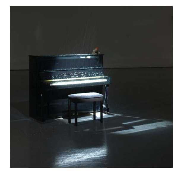
Figure 3. The Coy Lover (T. Lauschmann, 2011)